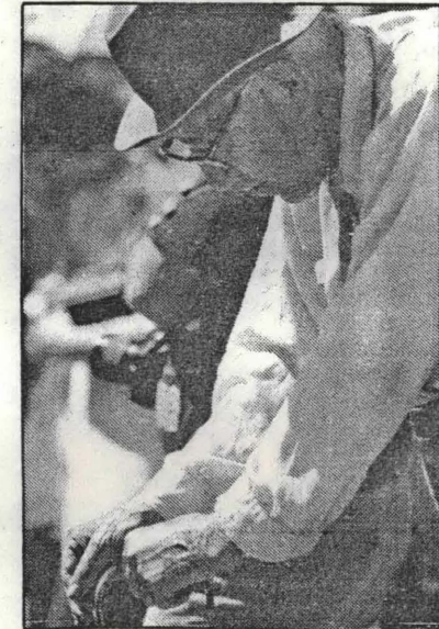
A man bows his head during the services.